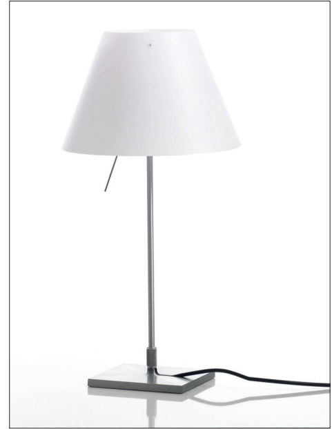
D13 pi. - D13 pi.c.